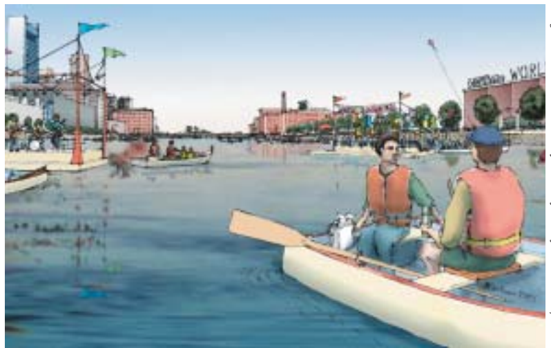
New and exciting activities coming to the Fort Point Channel.

In 1986, the most exciting thing to do on the Harbor was to watch the planes land at Logan Airport. Today, visitors from around the city, the region and the world can enjoy a trip to the Harbor Islands, a sunset cruise, or a whale watch.