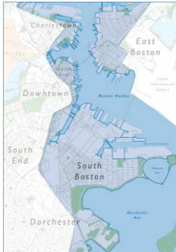
■ Study area

For the purposes of managing the scope of this project, we focused our study area on Boston's waterfront – from the Mystic River to the Neponset River. We encompass all of the land east of Interstate 93 from the Neponset Bridge, north through Dorchester, South Boston, the Seaport, Fort Point Channel, Downtown, and the North End. Crossing into Charlestown, the boundary follows US 1 to Medford Street west to the Malden Bridge. The neighborhood of East Boston is included west of the McClellan Highway. For the discussion of maritime trade, the Designated Port Areas of Chelsea and Everett were also included.