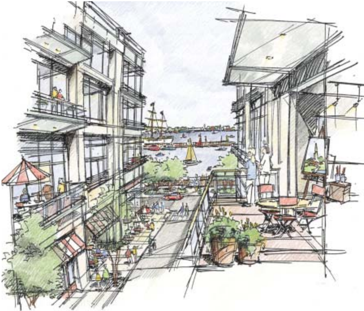
New housing and activity on the East Boston Waterfront.