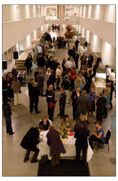
This year's winter warm up will take place again at Parris Landing.

Membership forms are enclosed in this newsletter. Checks for dues can be delivered to Navy Yard Bistro for a free appetizer with a meal or the Style