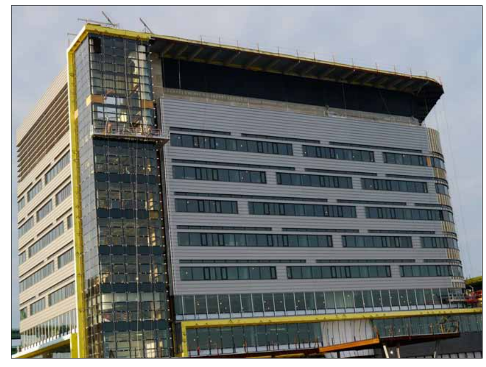
Spaulding Rehabilitation Hospital building was buttoned up in December, 15 months after breaking ground at Yard's End. Next year at this time, it will be preparing to open for patients.