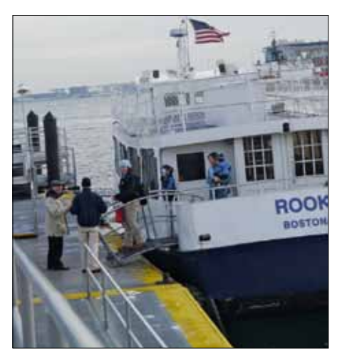
Charlestown residents and employees may see the end of MBTA ferry service, which currently has more than 200 round trips a week to Long Wharf.