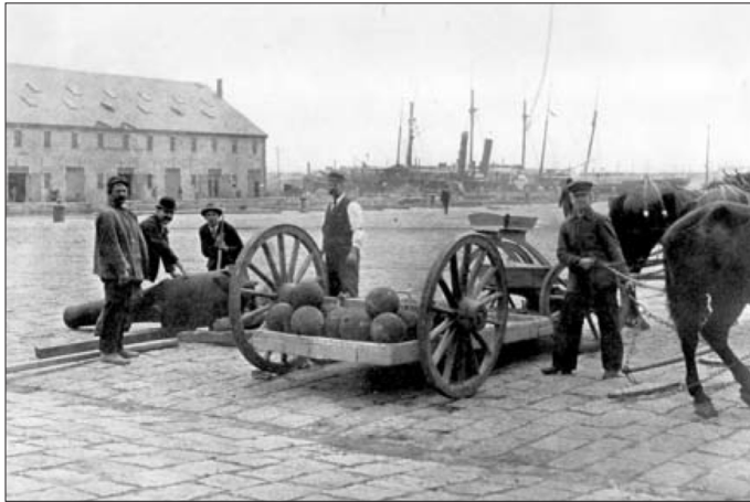
Above: View southeast in the 1890s of a cannon ball laden cart rolling over recently installed granite block pavers. Dry Dock 1 and the Carpenter Shop (Building 24) are visible in the background. From Boston National Historical Park Cultural Landscape Report , p.64, 2005.