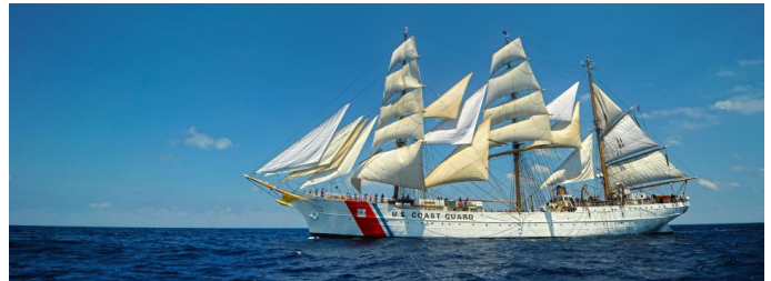
Barque Eagle , the US Coast Guard's training ship, will join "Old Ironsides" in the Navy Yard for the bicentennial celebration.

In anticipation of the bicentennial, the USS Constitution Museum is holding a lecture on May 22 by Lieutenant-