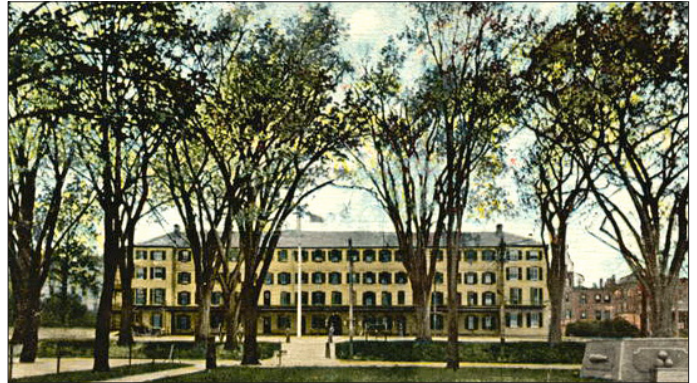
Marine Barracks was built in 1810-11 and remains the oldest such building in the country. Postcard circa. 1910-11